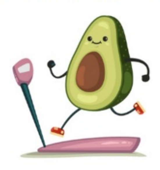
Exercise and healthy eating have positive effects .