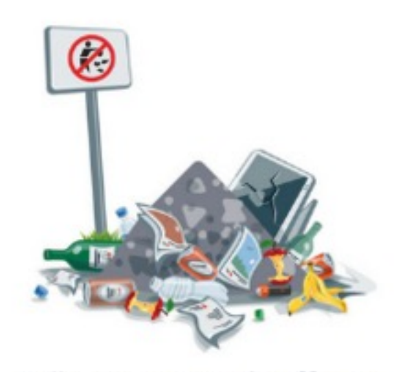
Pollution negatively affects the environment.

to influence; to produce a change in someone or something